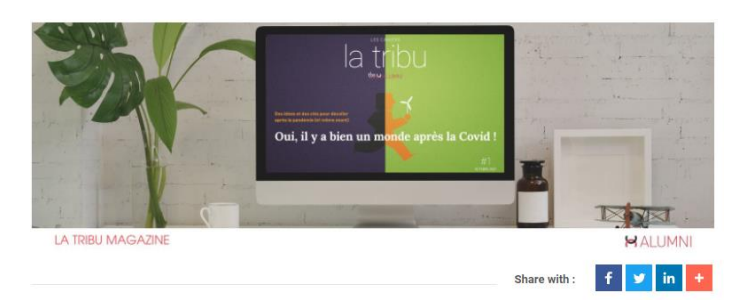
27 October 2021

We are happy to see that the student associations are getting closer to the alumni network each year, reinforcing our desire that TBS students understand that they are alumni as soon as they arrive at the School.