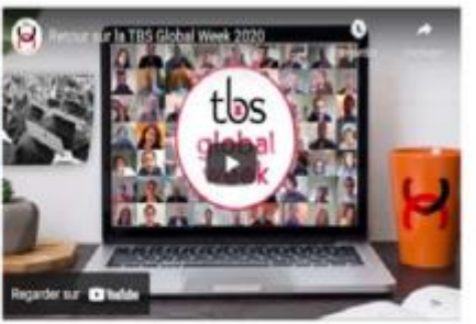
RETOUR SUR LATBS GLOBAL WEEK 2020

Thus, the first TBS Global Week was created.